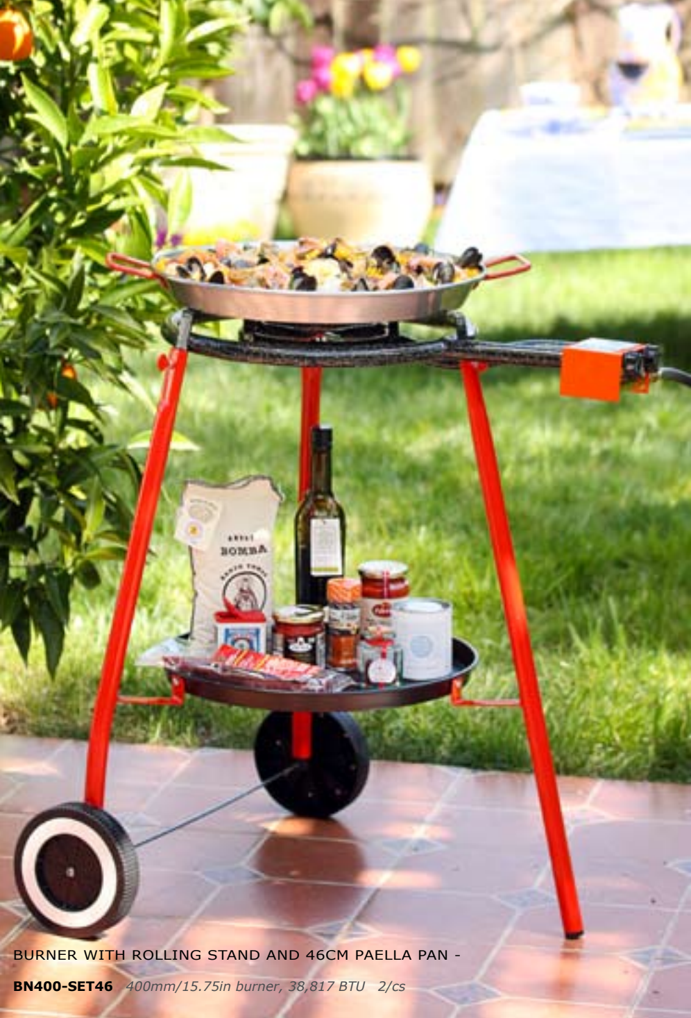
BURNER WITH ROLLING STAND AND 46CM PAELLA PAN - BN400-SET46 400mm/15.75in burner, 38,817 BTU 2/cs