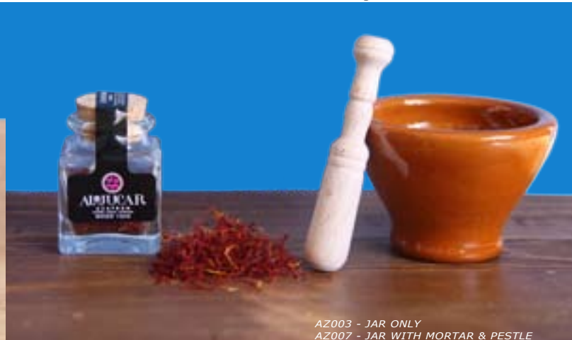
AZ003 - JAR ONLY AZ007 - JAR WITH MORTAR & PESTLE